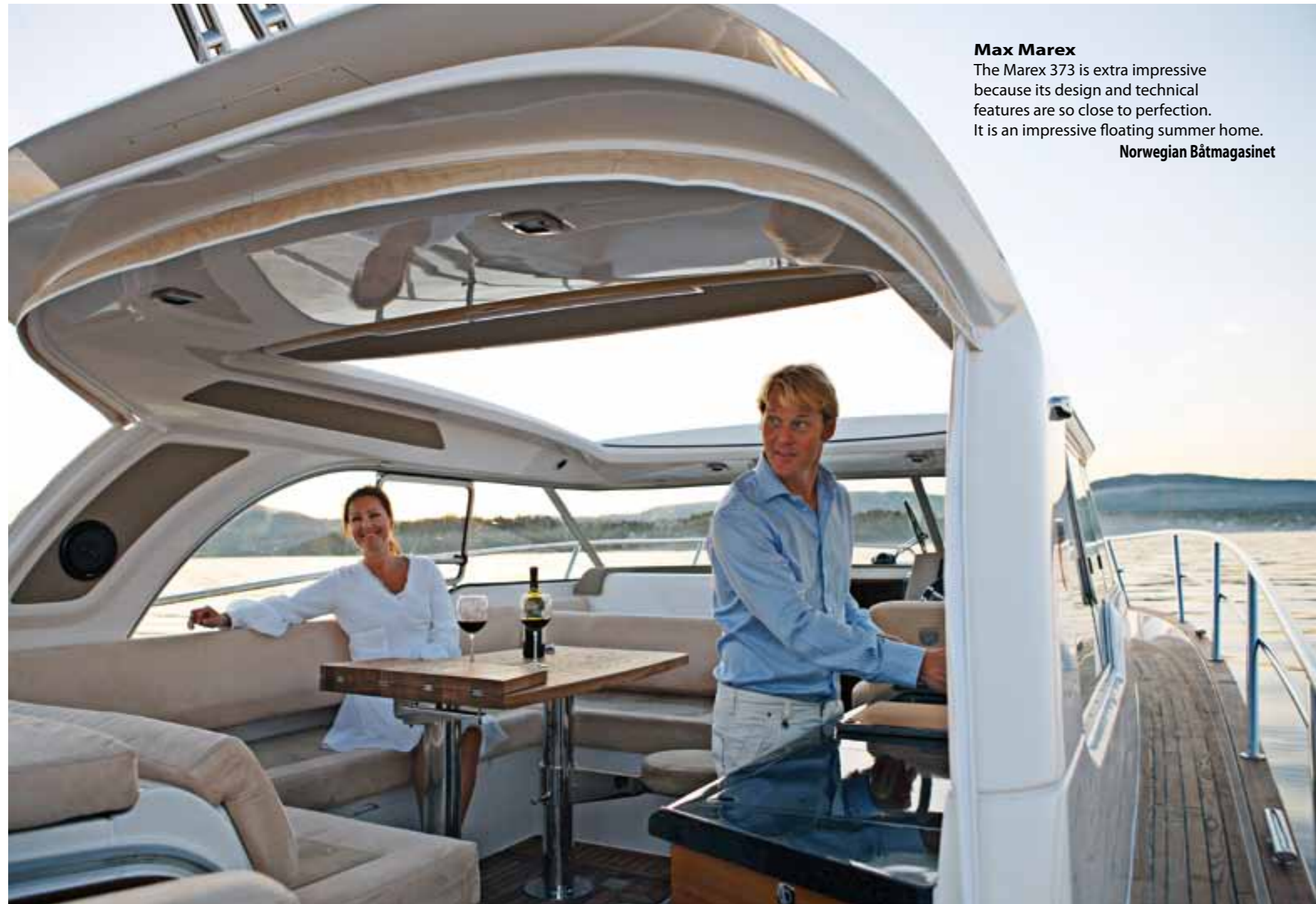
Max Marex The Marex 373 is extra impressive because its design and technical features are so close to perfection. It is an impressive floating summer home. Norwegian Båtmagasinet